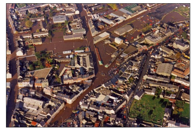
Aerial Photograph of Flooding in Strabane 22nd Oct 1987

All of Northern Ireland, with some limited coverage in the Republic of Ireland in border areas.